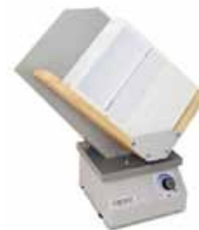
402 Series Jogger - an option which reduces static electricity from forms and aligns them for proper feeding