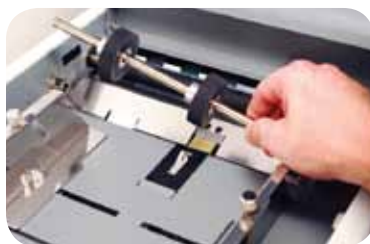
Removable Feed Wheels