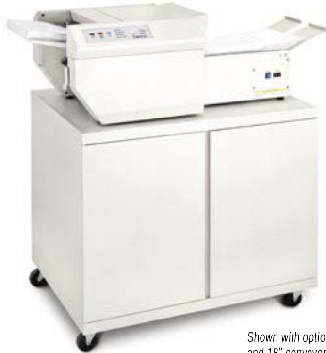
Shown with optional cabinet and 18" conveyor

The FD 2030 AutoSeal® desktop pressure sealer provides a reliable and compact solution for processing pressure sensitive self-mailers. Standard features include a six-digit counter, jog control, fault detection, L.E.D. indicators and an operator friendly touch-pad control panel. Up to 225 forms can be loaded in the feeder and processed at speeds up to 9,000 per hour. All of these features make the FD 2030 the perfect solution for streamlining your post processing. The FD 2030 is also available with an optional fully enclosed cabinet for storage, and a choice of two conveyors with photo-eye for neat and sequential stacking of processed forms.