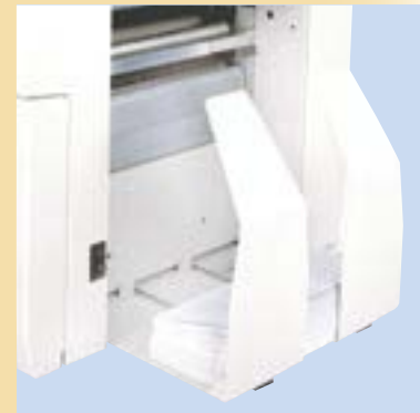
Standard Catch Tray

The FD 2030 is designed for user friendly operation. Simply set your folds according to the clearly marked settings on the fold plates, load your forms, press start and you're on your way. The FD 2030 has indicators for power on, fault detection, paper out and cover open for operator convenience. It also includes a six-digit counter for audit control.